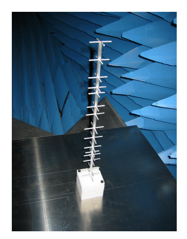
Figure 1: Computer graphics rendering of the best evolved antenna. It is 47 cm high, covers a 6 cm square footprint, and uses 1.587 mm radius wire. There are 15 crossed-elements.

operators - code that takes one or more design representations as input and outputs a design derived from them, and 3. fitness function - a function that evaluates a design.